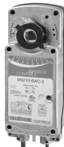
Figure 1: M9210-xxx-3 Electric Spring Return Actuator

The M9210-xxx-3 Electric Spring Return Actuators provide running and spring return torques of 89 lb-in (10 N·m). Integral line voltage auxiliary switches are available on the xxC models to indicate end-stop position, or to perform switching functions within the selected rotation range.