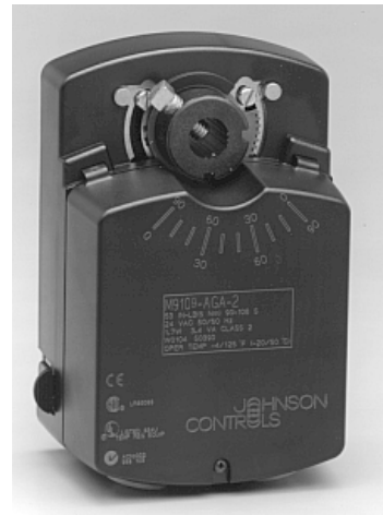
Figure 1: M9109 Non-spring Return Actuator

The M9109 models have an 80 lb-in (9 N-m) running torque. They have a nominal 60-second travel time for 90° of rotation at 60 Hz (72 seconds at 50 Hz) with a load-independent rotation time. The M9109-xGC-2 models are available with integral auxiliary switches to perform switching functions at any angle within the selected rotation range. Position feedback is available through a 0 (2) to 10 VDC signal on the M9109-GGx-2 models.